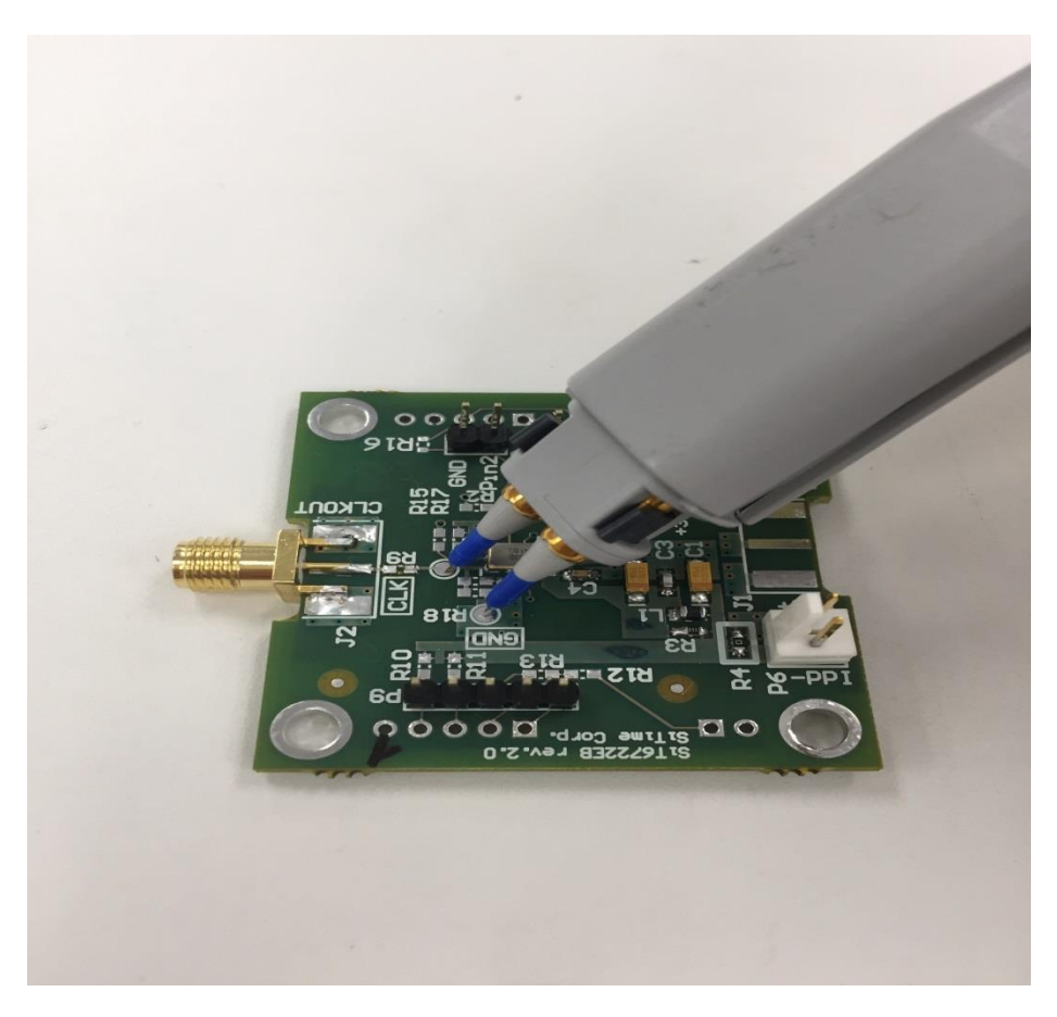
Figure 1. Proper Waveform capturing on SiT6722EB