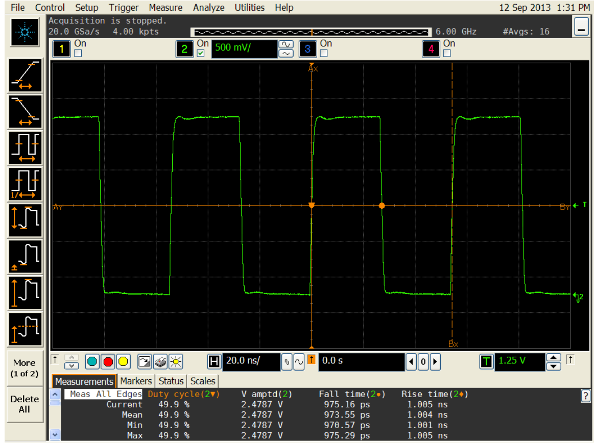
Figure 2. Duty cycle, Rise/Fall time and Amplitude 2.5V