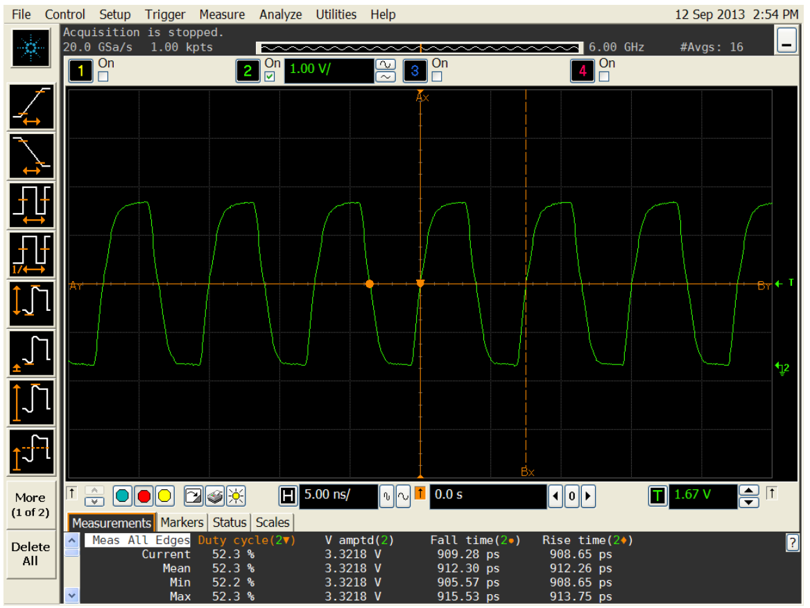
Figure 5. Duty cycle, Rise/Fall time and Amplitude 3.3V