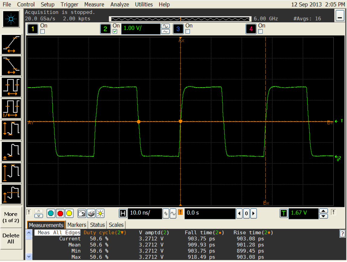
Figure 5. Duty cycle, Rise/Fall time and Amplitude 3.3V