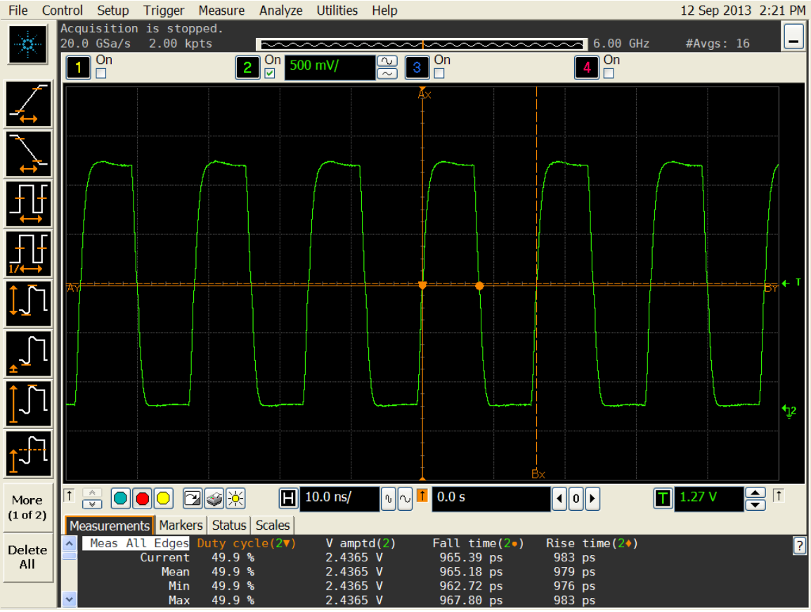
Figure 2. Duty cycle, Rise/Fall time and Amplitude 2.5V