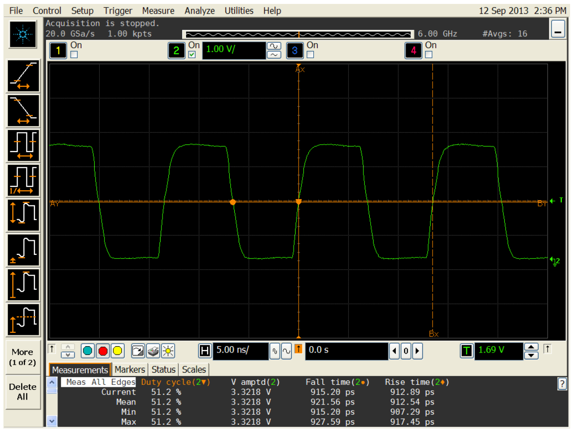
Figure 5. Duty cycle, Rise/Fall time and Amplitude 3.3V

The information contained in this document is confidential and proprietary to SiTime Corporation. Unauthorized reproduction or distribution is prohibited.