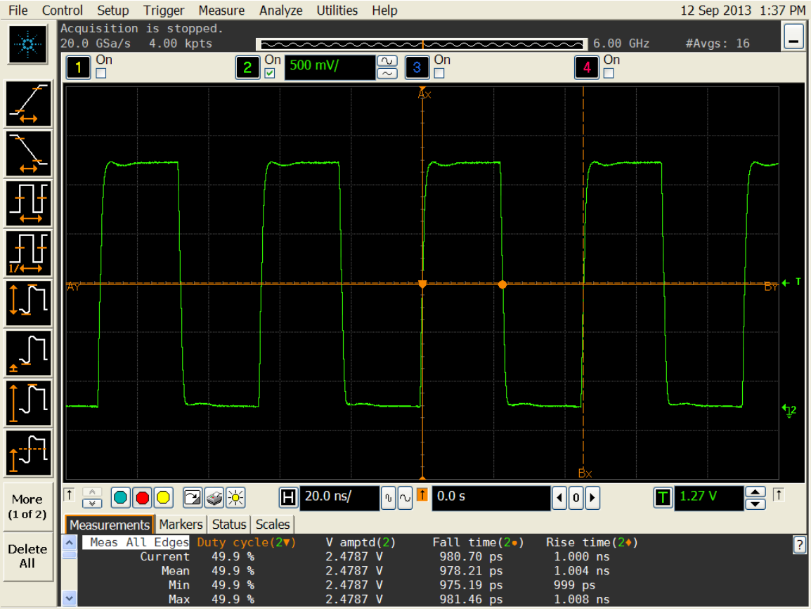
Figure 2. Duty cycle, Rise/Fall time and Amplitude 2.5V