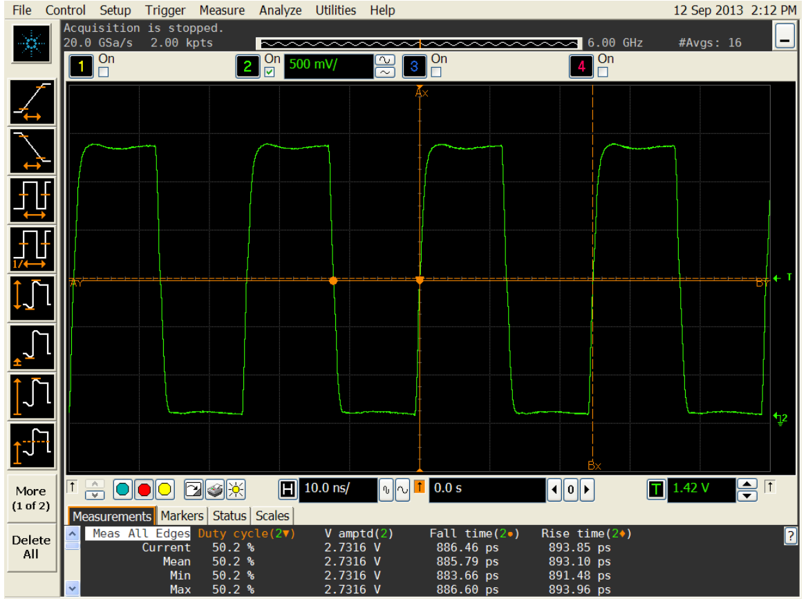
Figure 3. Duty cycle, Rise/Fall time and Amplitude 2.8V