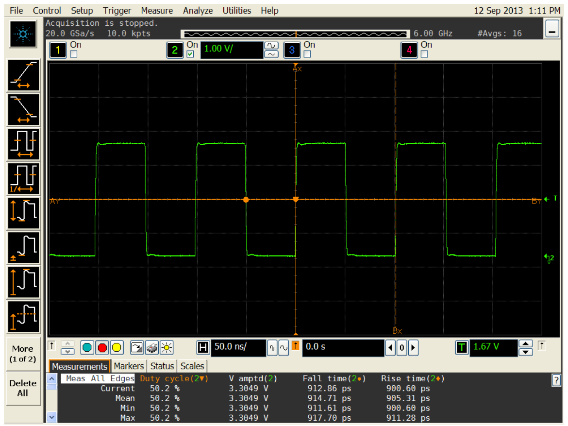
Figure 5. Duty cycle, Rise/Fall time and Amplitude 3.3V