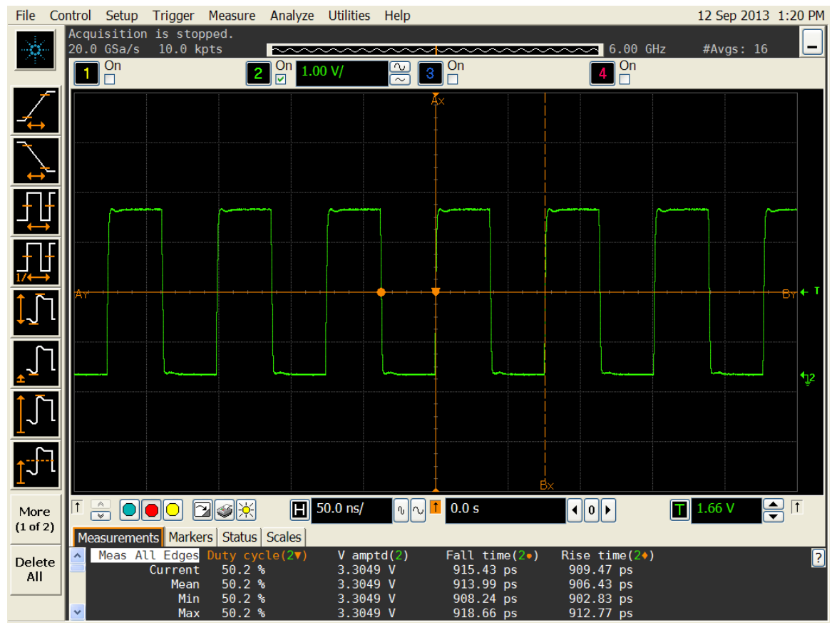
Figure 5. Duty cycle, Rise/Fall time and Amplitude 3.3V