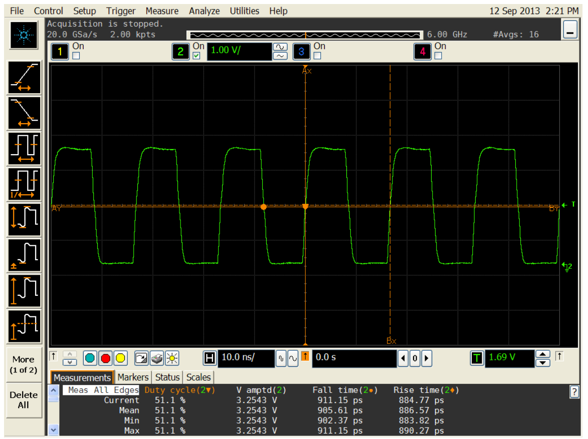
Figure 5. Duty cycle, Rise/Fall time and Amplitude 3.3V

The information contained in this document is confidential and proprietary to SiTime Corporation. Unauthorized reproduction or distribution is prohibited.