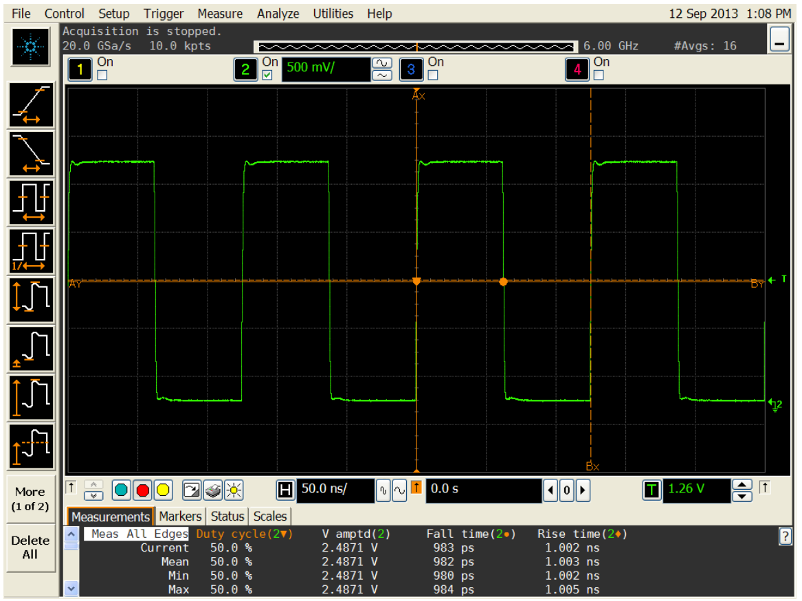
Figure 2. Duty cycle, Rise/Fall time and Amplitude 2.5V

The information contained in this document is confidential and proprietary to SiTime Corporation. Unauthorized reproduction or distribution is prohibited.